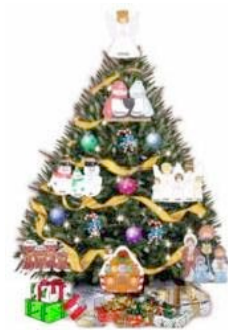
Trains for Christmas!!!